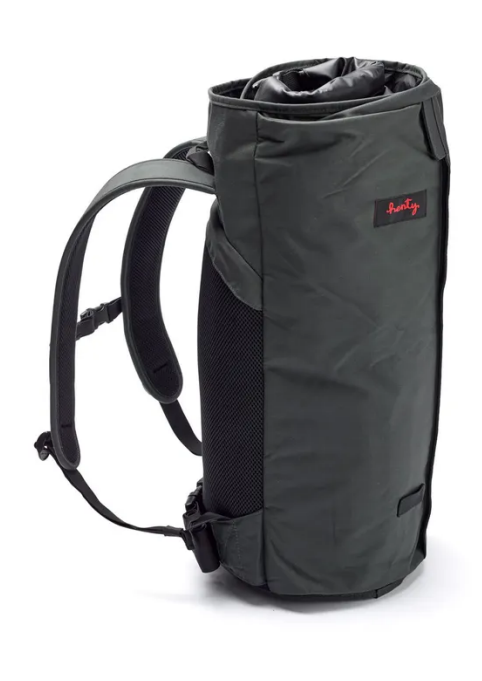
Henty Wingman Commuter Suit Bag