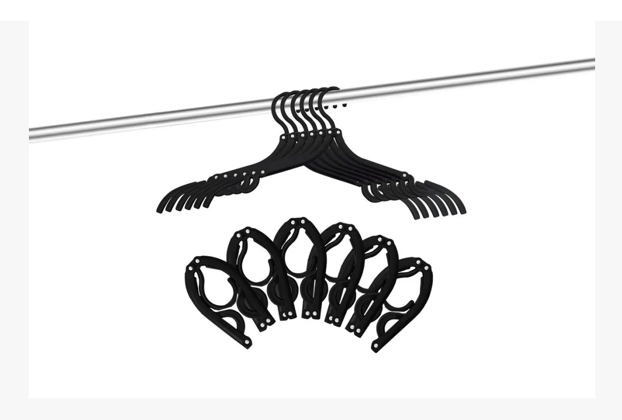
Trubetter portable folding clothes hangers