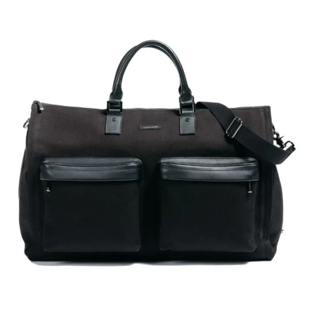
Hook & Albert nylon twill garment weekender bag