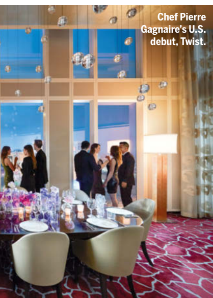
Chef Pierre Gagnaire's U.S. debut, Twist.

Are your eyes bigger than your stomach? Find out by booking a table at Blackout, a mystery dining experience where your seasonal, plant-based prix fixe meal is enjoyed in the dark. Too weird? Cheer up: Vegas is full of incredible food options.