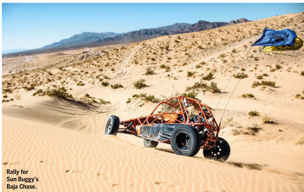
Rally for Sun Buggy's Baja Chase.