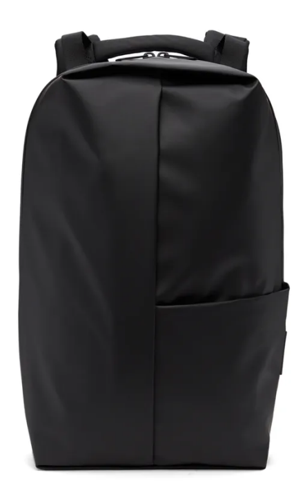
Cote & Ciel Sormonne obsidian backpack