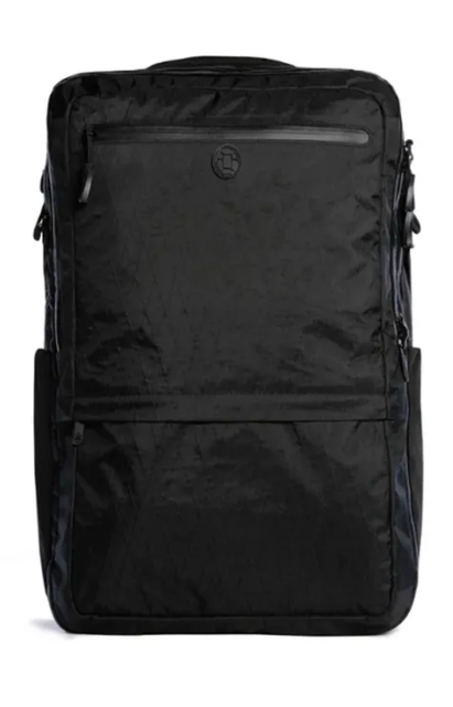
Tortuga Outbreaker backpack