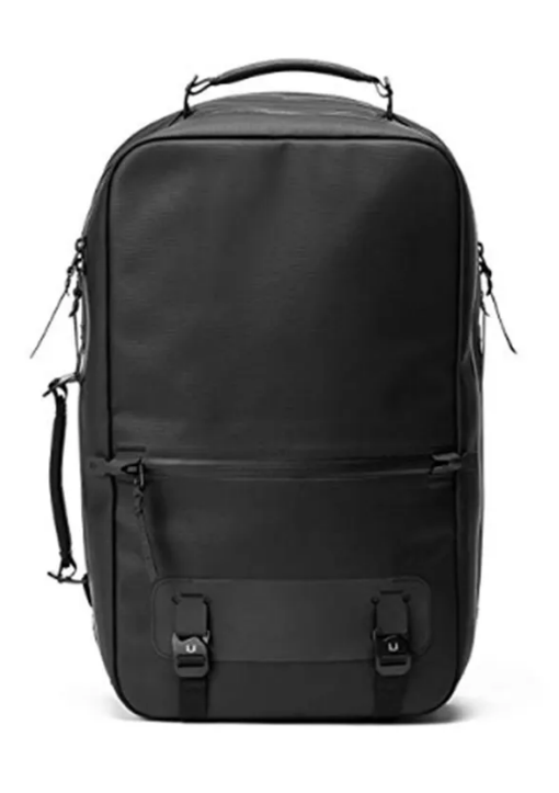
Black Ember Citadel R2