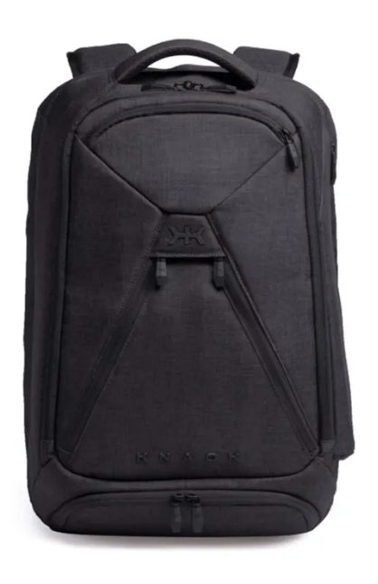
Knack Pack Medium Expandable Knack Pack