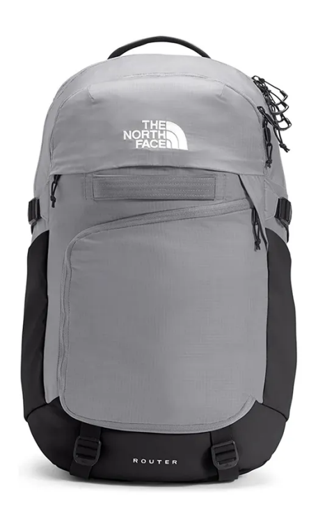
The North Face Router laptop backpack