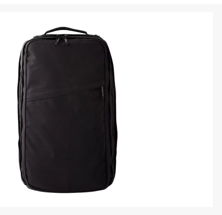
Goruck x Huckberry Slick GR2 travel backpack