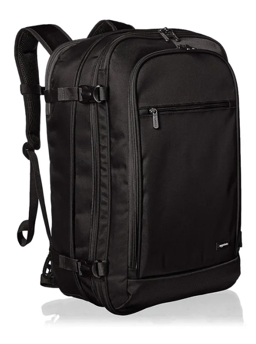
AmazonBasics Carry On Travel Backpack