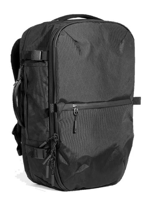
Aer Travel Pack 3 X-Pac