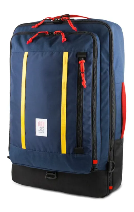
Topo Designs Travel Bag