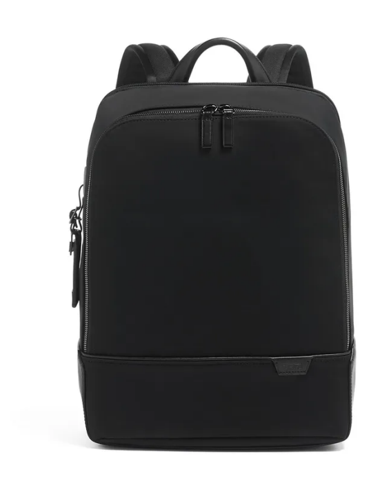
Tumi William backpack