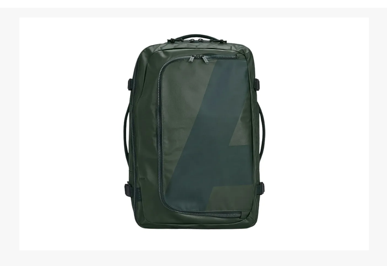
Away F.A.R. convertible backpack