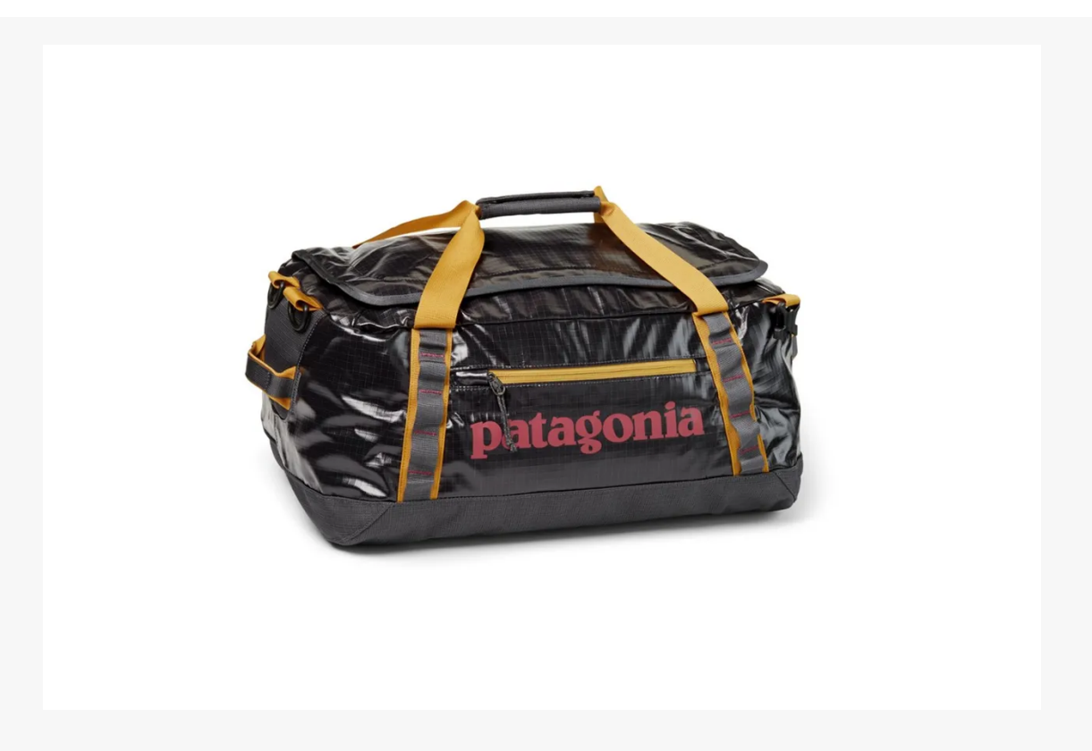
Patagonia Black Hole 40L duffel bag